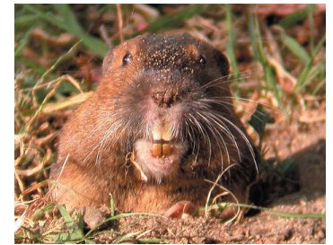
A pocket gopher rearranges the soil in Tennessee Valley.

"As a result of erosion, a significant amount of carbon is stored in the soil by burial and aggregation, which prevents it from being released back to