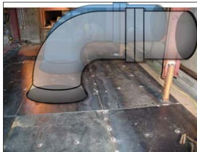
#5 Shaft Exhaust Ventilation Fans