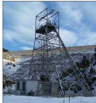
#5 Shaft Headframe