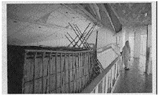
Fig. 13-4. The pharaoh's funerary boat.

The boat of a pharaoh was discovered in a sealed crypt and reassembled in a museum near the pyramids (see Fig. 13-4). Its wood was dated using <sup>14</sup>C to be about 4,500 years old.